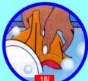
Washing Dishes In Unblocked Sink.