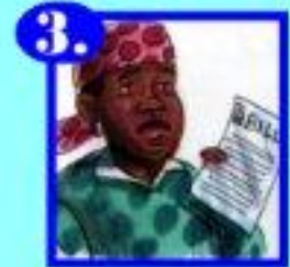
Not Paying bills every month