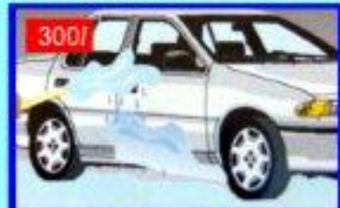
Washing A Car