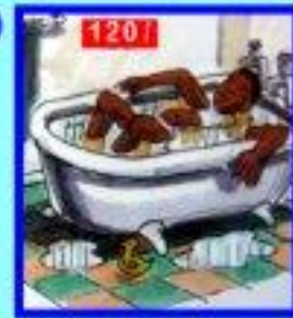
Taking A Bath