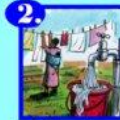
Using too much water.